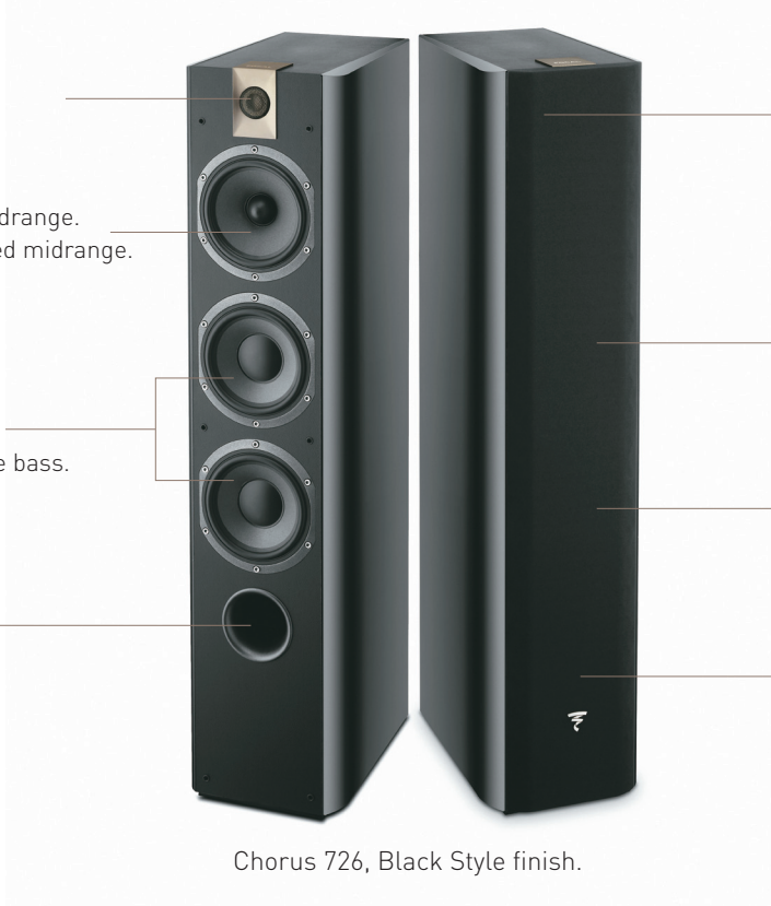
Chorus 726, Black Style finish.

New grille cloth design Better integration