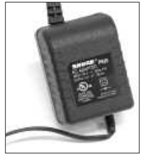
PS23US AC Power Supply

The Shure PS-21US in-line (120v AC) power supply is for use with mixer models 200M, FP22, FP33, and PGX4, SLX4 wireless receivers among other models. (Check your owner's manual for compatibility).