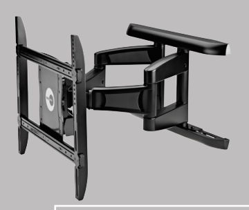
Full Motion Mount