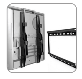
Keeping ease of installation in mind, the Cl175T was designed to be installed in a few simple steps