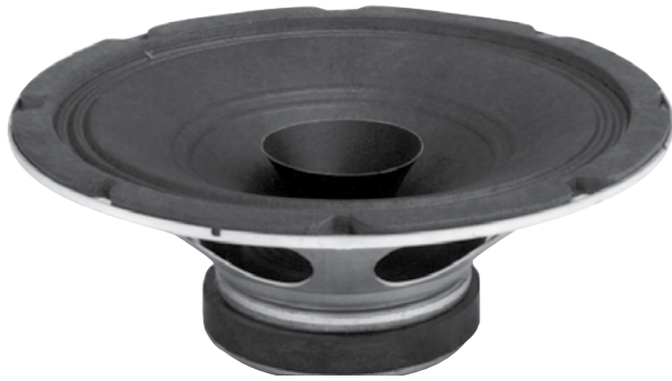
D Series (C10A Series Speaker)