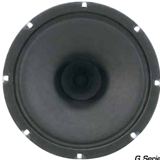
G Series (C5A Series Speaker)