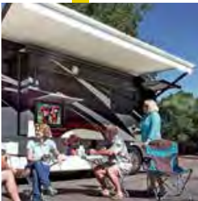
RV Parks & Campgrounds