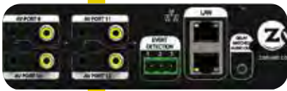
HDb2312 Rear Detail