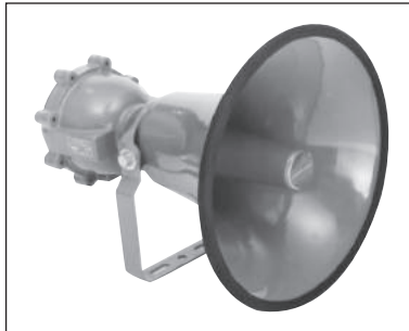
HLE-1 Driver mounted to HLE/MLE-32 Horn (order separately)