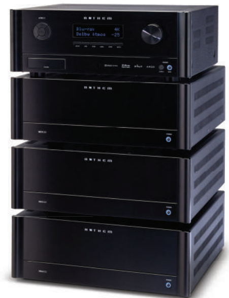
Two MCA 325s and a MCA 525 teamed with an AVM 60 Preamp

CREATE YOUR OWN DOLBY ATMOS 11-CHANNEL SYSTEM