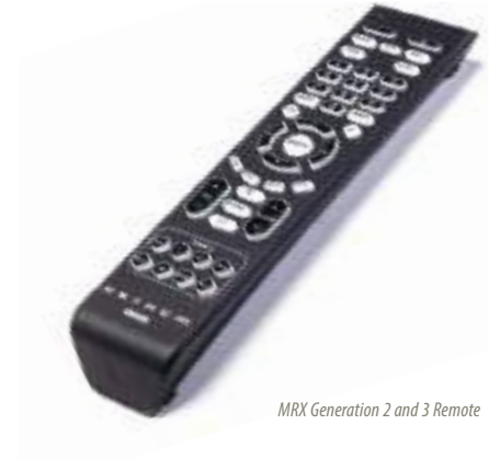
MRX Generation 2 and 3 Remote

MRX 1120 .....32 lb / 14.5 kg MRX 720 .....31 lb / 14 kg MRX 520 .....28.2 lb / 12.8 kg