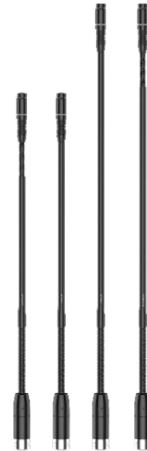
MXC Gooseneck Microphones