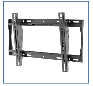
Includes Outdoor Tilting TV Wall Mount

BUILT-IN IR REPEATER Allows for IR control of 3rd party devices