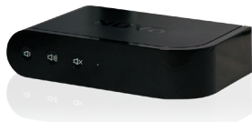
P300 Player Preamplifier

Ushering in the expansive source variety of Legrand's players, the P300 works with any external high-power amplifier to create a fully functioning zone. Offering all the same benefits and working in conjunction with all other Legrand Player Portfolio components, the preamplifier can conveniently be configured as a wired or wireless component to create the ideal system for your home's needs.