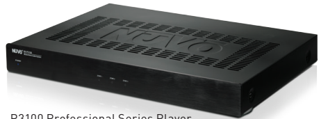
P3100 Professional Series Player

Ushering in the expansive source variety of Legrand's players, the P300 works with any external high-power amplifier to create a fully functioning zone. Offering all the same benefits and working in conjunction with all other Legrand Player Portfolio components, the preamplifier can conveniently be configured as a wired or wireless component to create the ideal system for your home's needs.