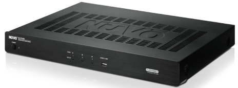
P3500 Professional Series Player

The professional series players deliver the same high-fidelity sound, convenient app control, and incredible digital audio source variety as Legrand's single zone players, but in a unique, rack-mountable, 3-zones-in-1 package. Supplying three simultaneous streams to three separate rooms, while also working in conjunction with the P100 and P200 players for additional zones, the P3100 and P3500 mean enjoying the most customized high-performance solutions, perfect for any home.