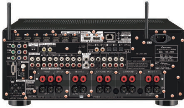
SC-LX801(B) UPC: 889951000204