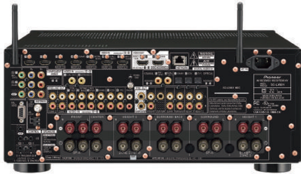
SC-LX901 (B) UPC: 889951000198