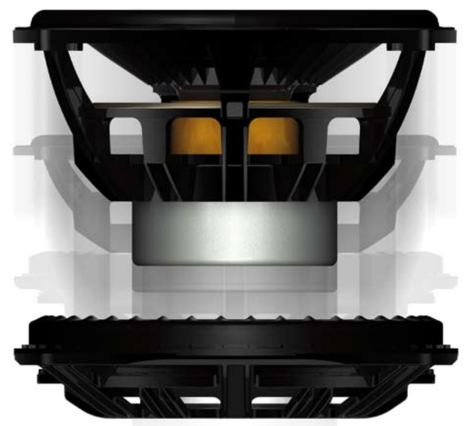
KEF's patent pending ultra-slim bass driver

Conventional high performance bass driver