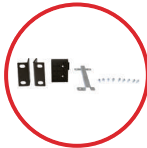
RMK-2 Two-unit rack mount kit