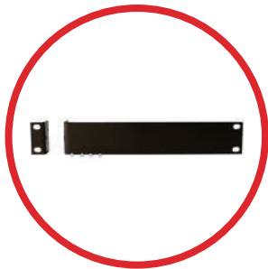
RMK-1 Single unit rack mount kit