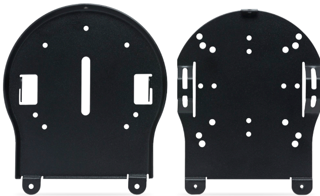
PTZ-CMB1 Ceiling Mounting Bracket