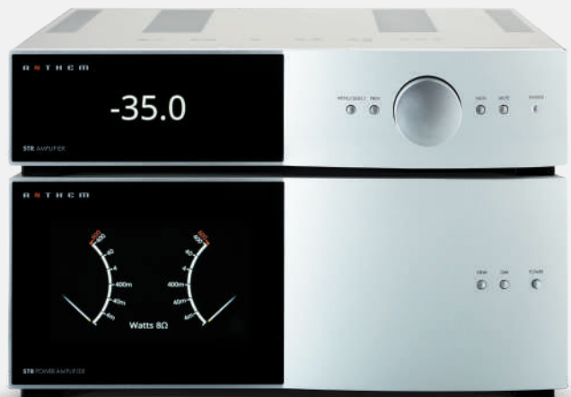
STR Preamplifier pictured with STR Power Amplifier (sold separately). Both models available in black or silver finishes.