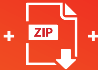
ARC® Genesis Software (free download)